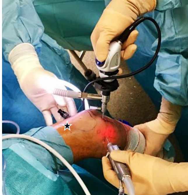
Figure 2: Left elbow, external view of the portals: The scope is in the direct or soft spot posterior portal and the instrument in the accessory posterolateral portal. Proximal anteromedial portal (black star) is used only for continuously fluid flow to maintain a good distension of the capsule for better visualization and avoid swollen soft tissue on the posterior working zone.