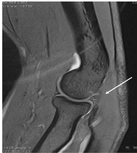
Figure 1: Sagittal magnetic resonance image showing an enlarged and thickened posterolateral synovial fold (white arrow).

An infiltration test with steroid and local anesthesia was applied with the diagnosis suspicion and in all cases the symptoms disappeared but came back at 6-8 weeks later. Operative Technique: All patients were positioned in the lateral decubitus position and used a tourniquet for the entire procedure. The pivot shift test in the posterolateral zone was made to exclude the possibility of instability [10]. The procedure was begun with the proximal anteromedial portal [11]. The sheath and trocar are inserted 2cm proximal the medial humeral epicondyle and directly anterior to the intermuscular septum avoiding the ulnar nerve and always maintaining contact with the anterior humerus to avoid risk to the median nerve.