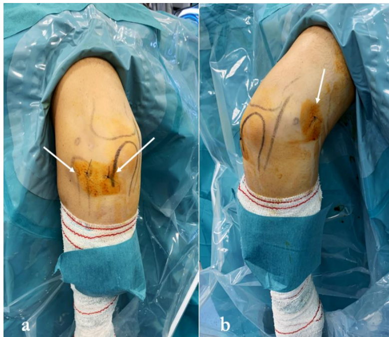
Figure 3: Left elbow. External view of the portals at the end of the surgery. a) Direct posterior or soft spot portal and accessory posterolateral portal. b) Proximal anteromedial portal.