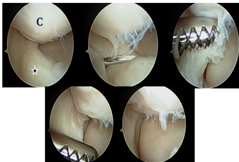
Figure 4: Arthroscopic view showing debridement and removal of a posterolateral synovial fold performed with a motorized shaver. (C, Condyle); (Black star: Posterolateral synovial fold).